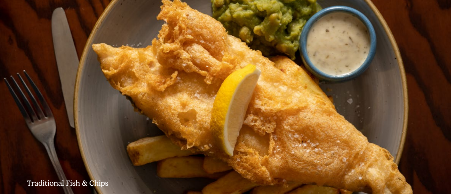
Traditional Fish & Chips