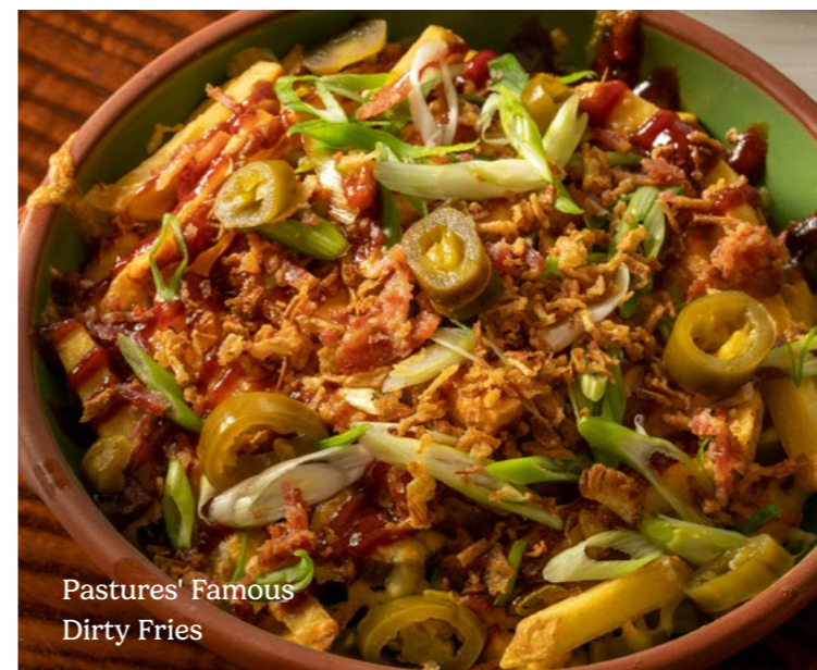
Pastures' Famous Dirty Fries

French fries smothered with BBQ sauce, bacon lardons, jalapeños, spring onion, melted cheese and crispy onions