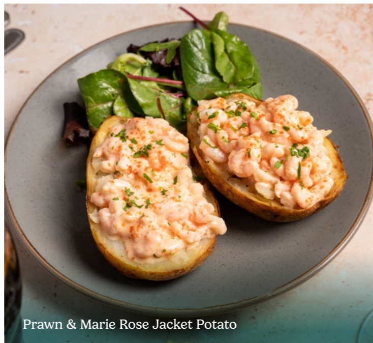
Prawn & Marie Rose Jacket Potato

Cajun spiced chicken, onion, salsa, Monterey Jack cheese