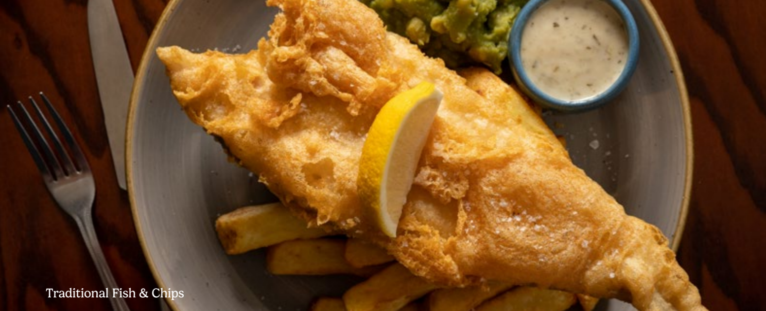
Traditional Fish & Chips