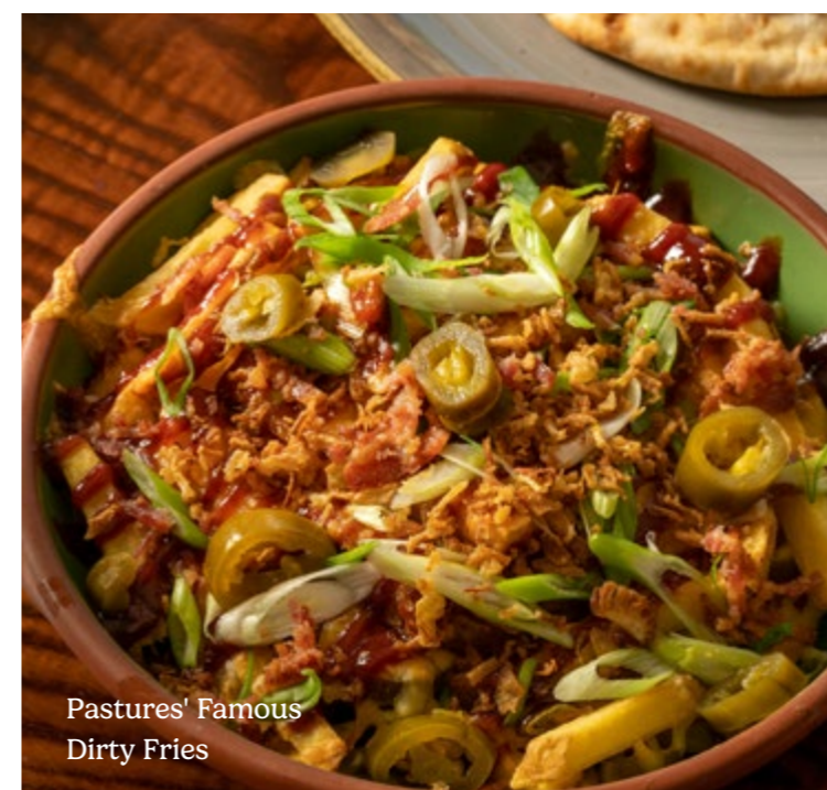
Pastures' Famous Dirty Fries